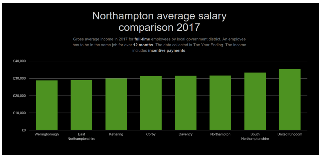
Table 3: Average Salary County comparison

Table 3 below sets out the local comparison between wage levels. The picture across Northamptonshire is relatively similar, with only South Northamptonshire offering a higher wage than Northampton. This can be attributed to the specialism South Northamptonshire has around its dominant sectors, which includes high performing manufacturing to support the Motorsport industry.